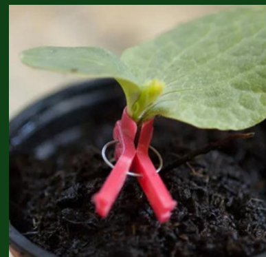
Cucumber grafting technique

Coffee, goodies and raffle tickets available. Guest speaker at 8pm.